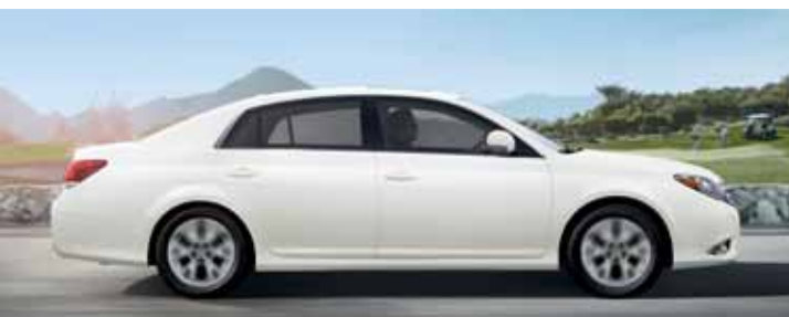
XLS shown in Blizzard Pearl.